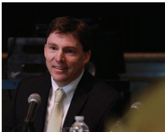
Hon. Douglas Hurd