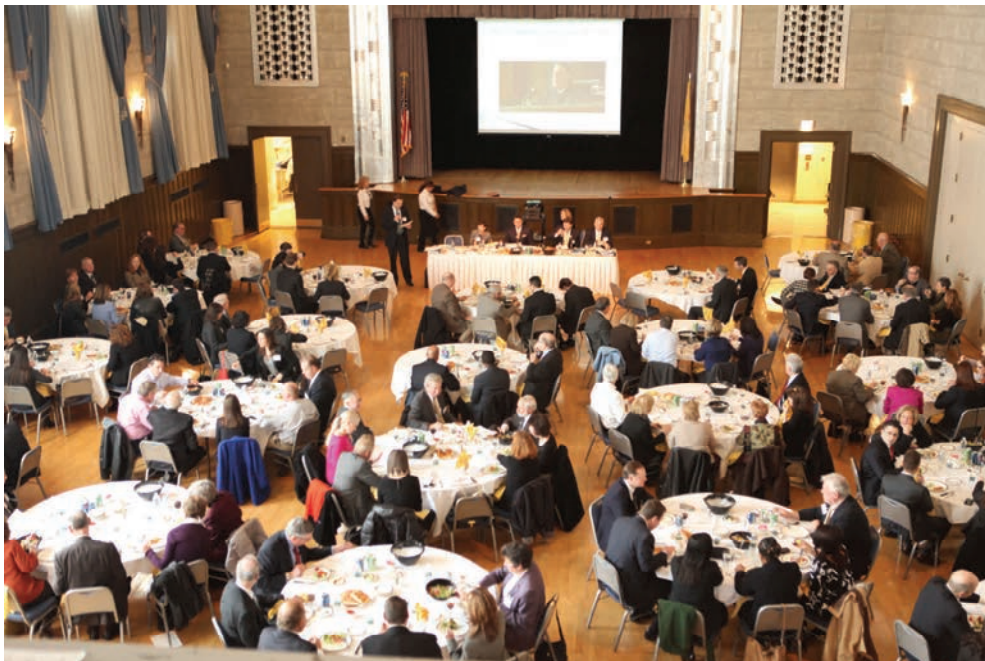
150 members of the Bench and Bar gathered together on March 26th at the Trenton War Memorial for a panel discussion of Ethics and Social Media.