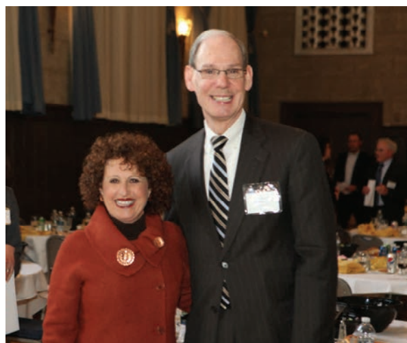
Hon. Bonnie Goldman and Hon. Paul Catanese (ret.)