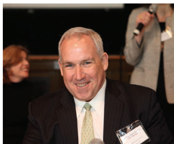
Hon. Peter Warshaw